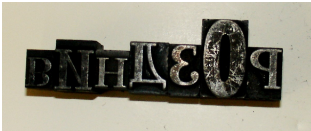
ABOVE: 'WINDSOR' in Serbian Cyrillic, authentic metal typecasts from SHM collection.

We invite you to enter into the houses of Avala Printing and Publishing Company, Mišić Printing and Perun Press to learn of yet undiscovered