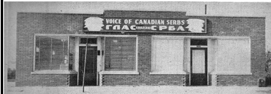
1297 Drouillard Rd, Windsor/ON— Voice of Canadian Serbs headquarters and Avala Printing and Publishing Company Ltd.

Publishing has been an important part of maintaining Serbian culture in Canada. Many talented people had the need and desire to publish their works. Avala Printing and Publishing Company Ltd. gave this opportunity to many Serbs who expressed and recorded their experiences and thoughts. Among them were researchers who published a number of books and publications.