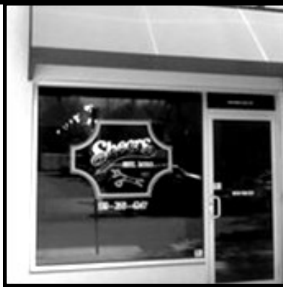
Current storefront "Sheers Hair Salon" where Mišić Printing used to be located.