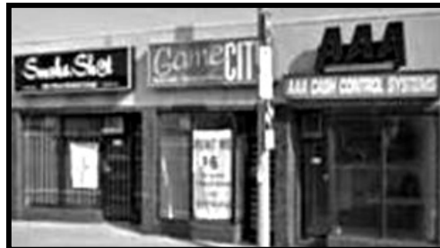
Perun Press former location. Currently occupied by "Game City".